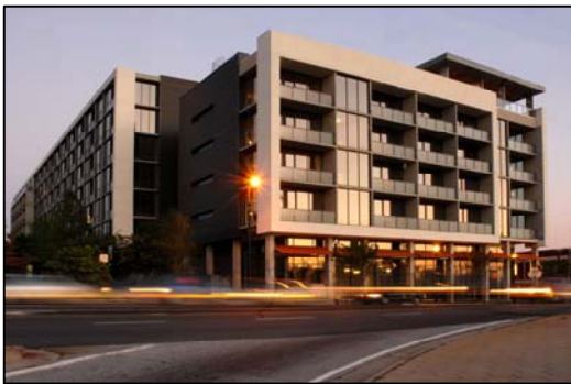
Tribute Lofts in the Eastside TAD

For the past ten years, the growth of property value in TADs has outpaced the property value growth of the city as a whole. The 10 TADs in the city of Atlanta have an annual growth rate of 30% while property values in the City grew only 8% over the same period. TADs have spurred the creation of approximately $2.3 billion of property value growth over the past decade. Since 2001, the city of Atlanta has issued $410 million in TAD bonds, which leveraged private capital of $4.5 billion. The resulting investment has created more than 2,400 construction jobs and 6,500 permanent positions. Additionally, the construction of 8,000 housing units and 4.2 million square feet of commercial space can be attributed to these investments.