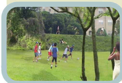
Proposed vision of Maddox Park after the BeltLine.