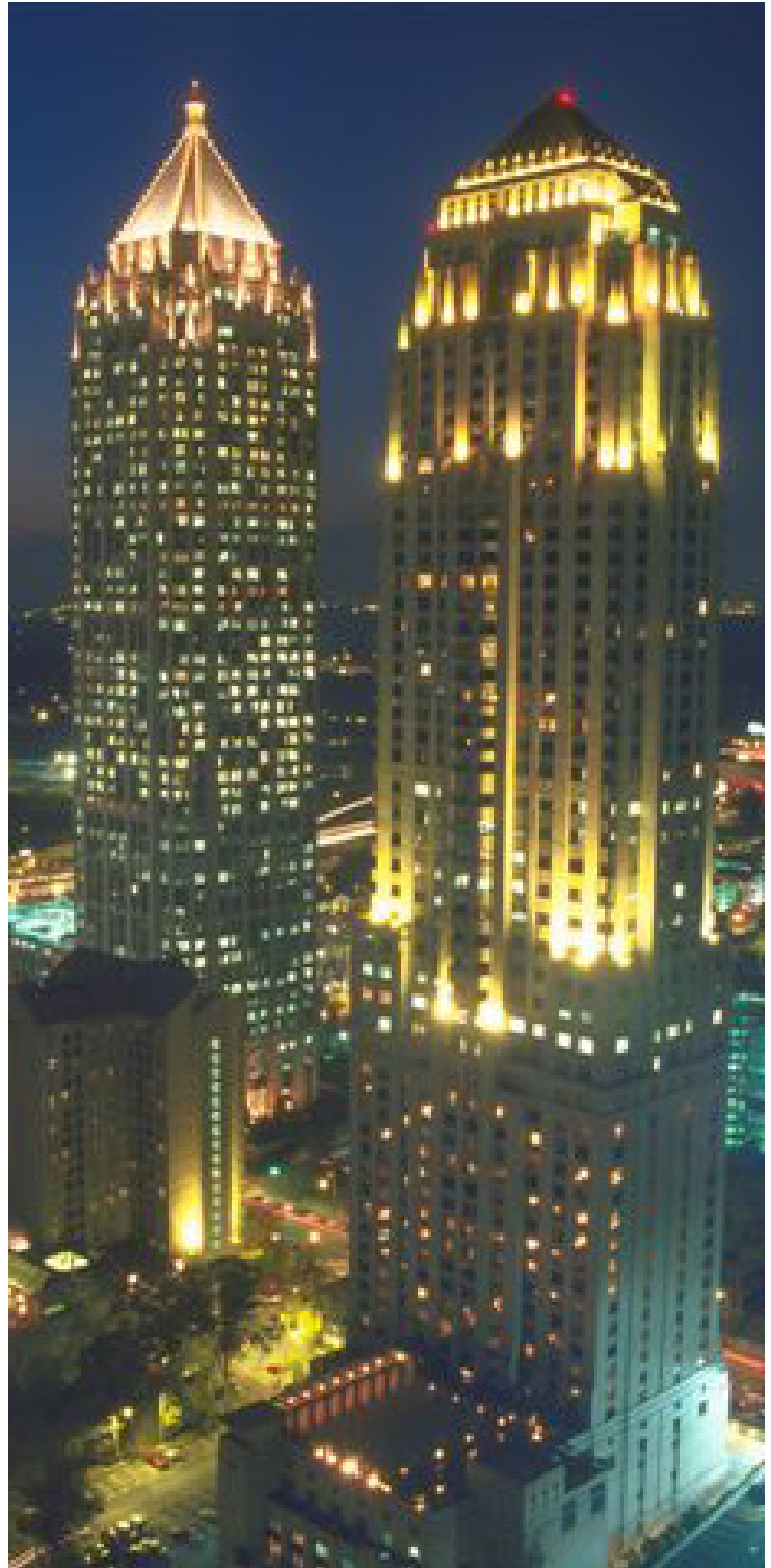
Downtown sky-scrapers at night