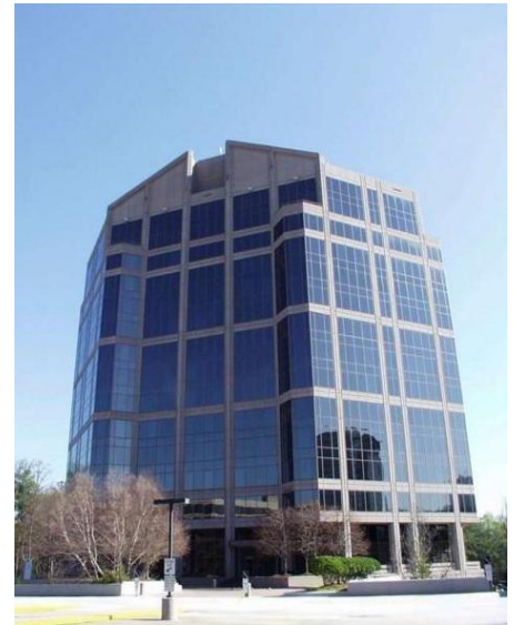
Piedmont Center 14 will house Wipro's first U.S. development center

Bangalore, India-based Wipro Technologies recently leased office space in the City of Atlanta for a new global software development center that will employ up to 1,000 people.