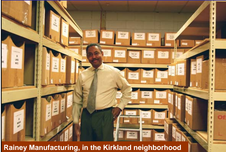
Rainey Manufacturing, in the Kirkland neighborhood