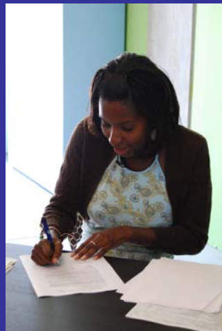
Teacher closes on her new condo at Oakland Park

* Includes PITI and assumes loan amount $127K, 30 yr fixed, 5%.