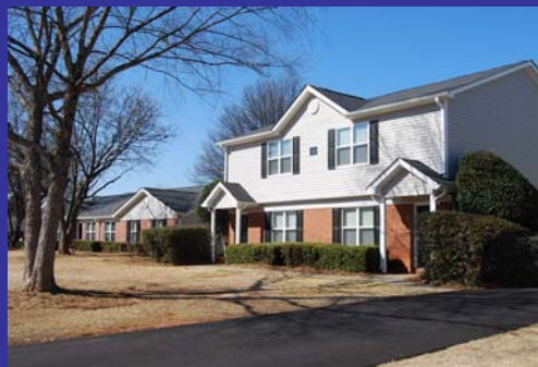
Amal Heights on Pryor Rd, 192 units