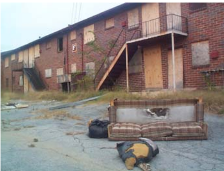
Before: Perry Homes

It's worth noting that this worthy cause is partially funded by TAD dollars.