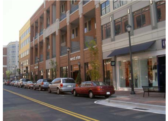
Atlantic Station, 2006

The purpose of the upcoming referendum, on the ballot on November 4, 2008, is to restore the ability of local boards of education to opt into a TAD. It's all about restoring local control to schools. Additionally, given the dire state of today's economy and capital markets, TADs will be even more of an asset in attracting investment and jobs to Georgia.