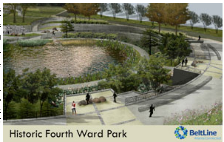
Historic Fourth Ward Park

To see the BeltLine for yourself, take a free bus tour offered by the BeltLine Partnership. Tours run every Friday and Saturday morning. For more information, visit www.beltline.org . The BeltLine needs your vote in support of Amendment 2 this November!