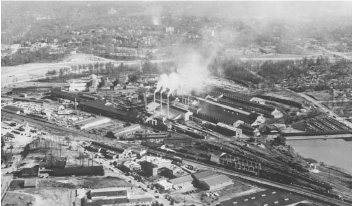
Site of Atlantic Station, c. 1950

TADs have been around for 50 years. Midtown Atlanta's own Atlantic station, a 138-acre former brownfield, is a well known and nationally commended example of a successfully implemented TAD. Today, TADs are a national best practice, approved by the laws of 49 states. In fact, all but three of those 49 states permit the participation of local school districts.