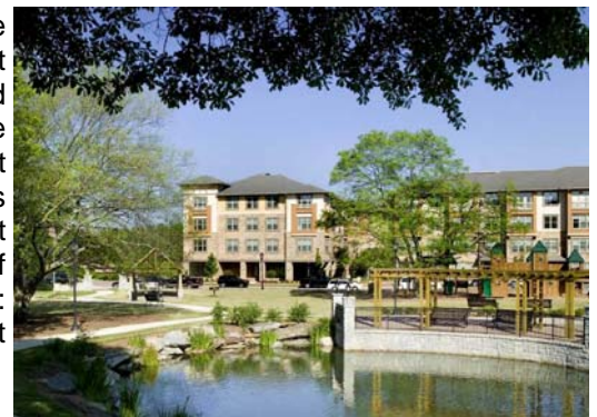
After: the West Highlands development

TAD funds also contributed to the revitalization of two of Atlanta's most distressed public housing projects: Capitol Homes, in the Eastside TAD, and Perry Homes, in the Perry-Bolton TAD. AHA received $5.3 million for the redevelopment of Capitol Homes, which it transformed into the now vibrant Capitol Gateway mixed-income community on Metropolitan Parkway. AHA is also slated to receive over $10 million towards the development of West Highlands, on the former site of Perry Homes. The redevelopment of both of these housing projects has had an impact on the surrounding communities: the quality of life there has dramatically improved and new development abounds.