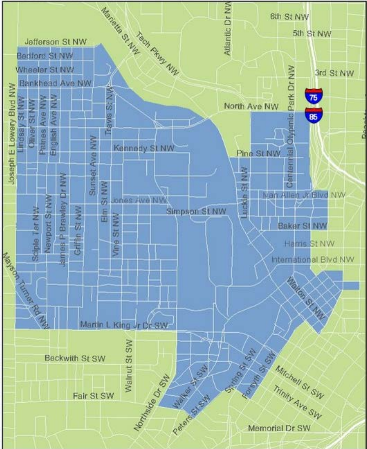
EXHIBIT A- Westside TAD